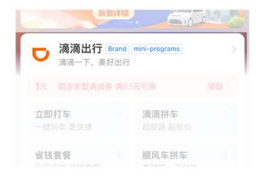
Tapping the logo will bring you to the miniprogramme.

Important! Sometimes the Didi driver wants to confirm that the right person boarded their taxi. They do this by verifying the last four digits of your phone number. The taxi driver will ask you fort he last two/four numbers of your phone number in Chinese and you can confirm if they are correct. (A simple OK or hao 好 will often be enough!).